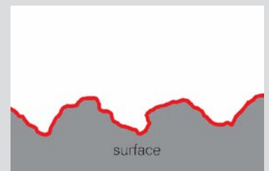
The result: a durable, permanent protective layer.