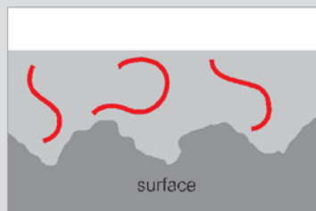
Touch dry within 4-6 hours